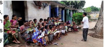
Evangelists reach villages with the Gospel with good results!