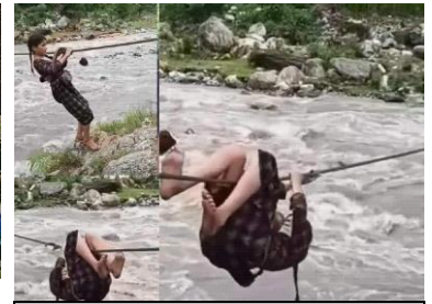
Sometimes, the way to school is the hard way!